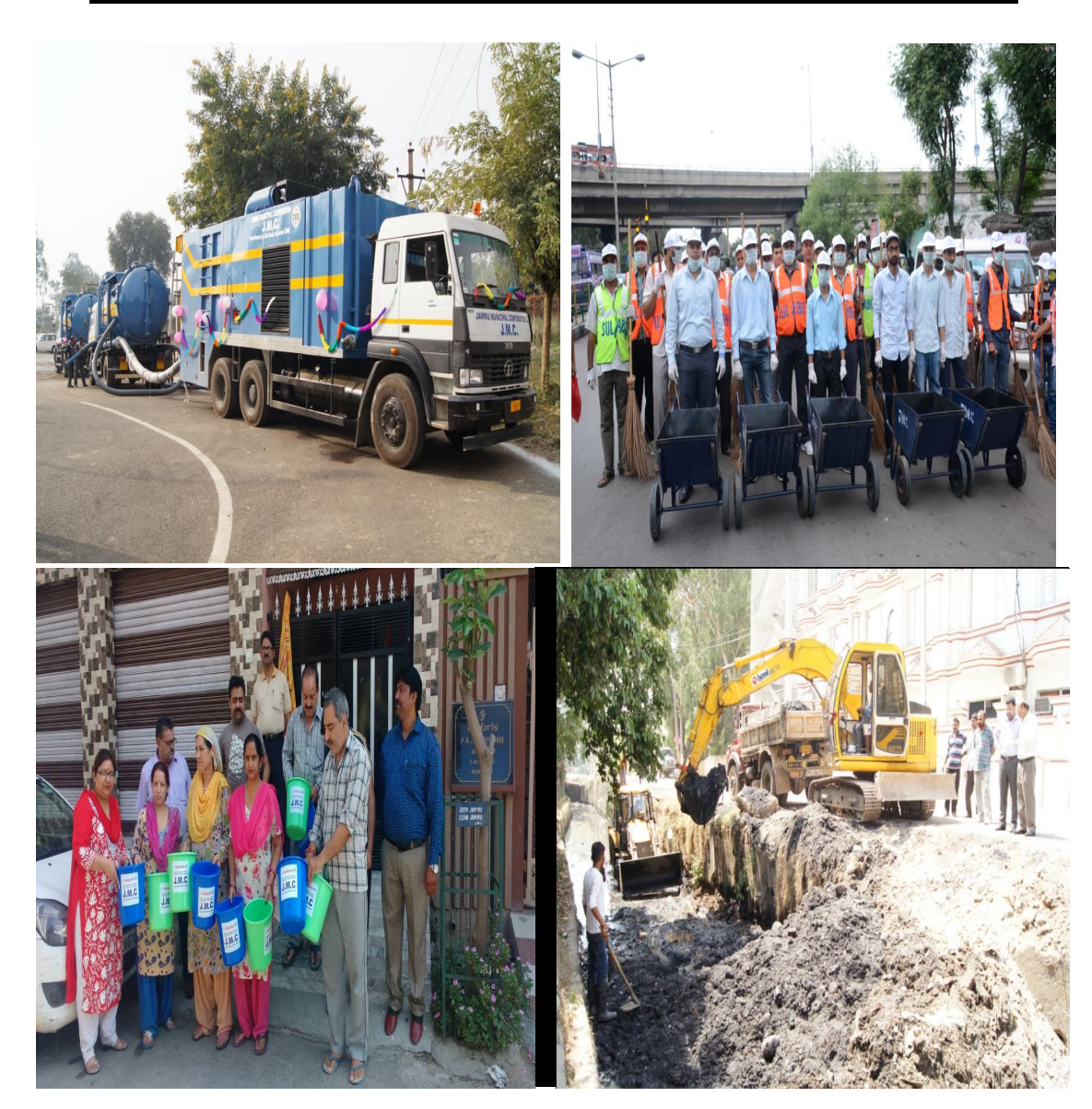
JAMMU MUNICIPAL CORPORATION JAMMU & KASHMIR